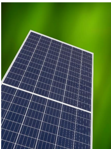
REC TwinPeak 2 REC TwinPeak 2S 72

Munich, January 10, 2019 – REC Group , the largest European brand for solar photovoltaic (PV) panels, announces new product and power warranties on its premium and multi-award-winning REC TwinPeak and REC N-Peak high performance solar panels. Applicable to all deliveries since October 1, 2018, REC has doubled the product warranty duration from 10 to 20 years across the range, and reduced the annual power degradation of the panel, so that customers can now look forward to even greater guaranteed output over the lifetime of the panels.